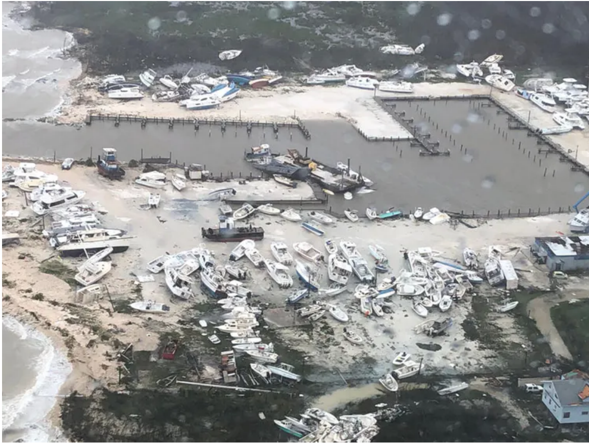
Hurricanes like Dorian make obvious news stories. The slow rise of atmospheric carbon, not so much.

Nevertheless, this issue cannot be explained in these terms alone. The most recent study into news values suggests that “bad news” and “magnitude” are two of the key elements in stories that become news. The extinction of much of the life on earth certainly meets both of these criteria. But when it comes to climate breakdown, these important news values can clash with the values of what the same study describes as the “newspaper agenda” and “the power elite”. This means that power structures within the mass media prevent climate change being covered as a topic of great importance.